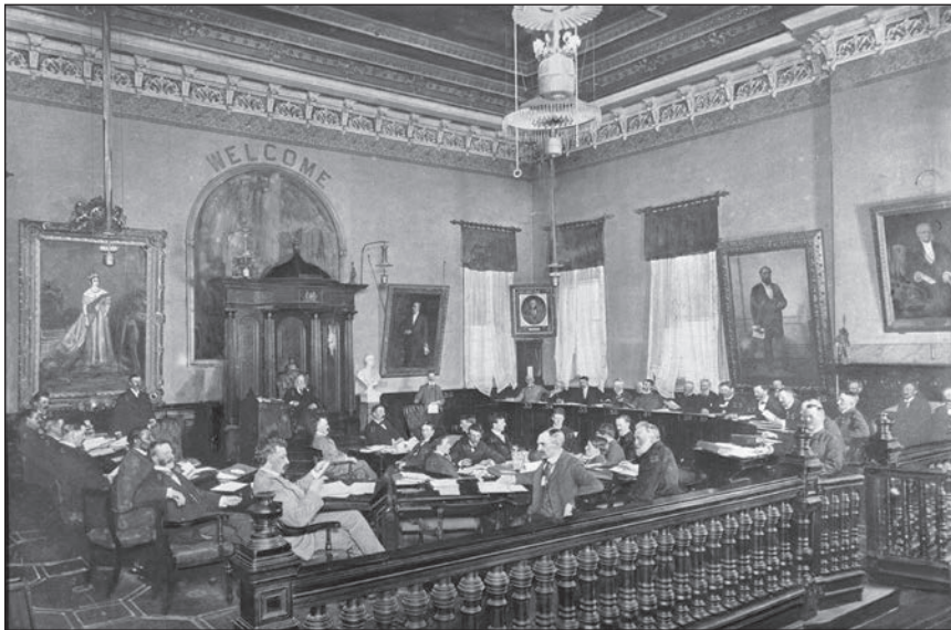
Toronto's city hall interior showing council in session, 10 July 1899. This was a historic moment, being the last council meeting in the 1844-1899 building.

clusion. The new working class was increasingly shut out of the public political forum of Toronto City Council, and the artisans who had once bridged class divides through their service on council were no longer capable of fulfilling that role.