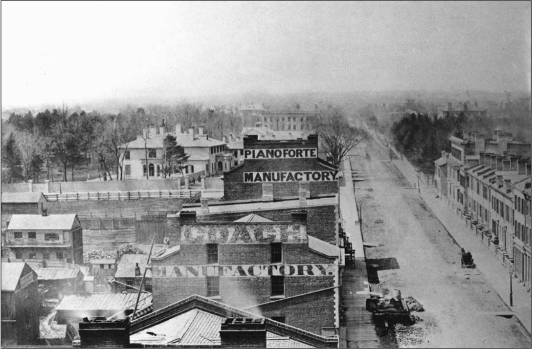
Toronto from the top of the Rossin House Hotel, looking west along King Street West in 1856. Note the Pianoforte "Manufactory" and Coach "Manufactory." The language is significant as historically "manufacture" preceded mechanized factories by several decades (Marx, 1887; Blumin, 1976). It was a transitional form in which large numbers of craftsmen were organized to work together in sequence or to do the same kind of work (making needles, etc.). According to Blumin, a large number of workers appeared before the advent of factories. In some ways, they were craftsmen, but in a state of degradation.

There can be little doubt that by the 1880s much work formerly conducted in small workshops was undertaken in factories. The important change was an increase in the size of the workplace. In 1870, thirty-eight per cent of Toronto's industrial work force was employed in factories of over a hundred workers. Another twenty-one per cent worked with between fifty and ninety-nine other employees, and eleven per cent worked in shops with between thirty and forty-nine other employees. 41 In