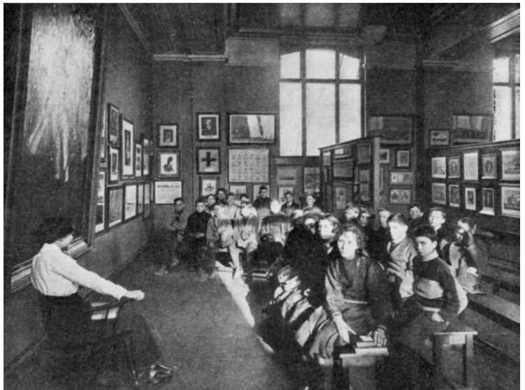
"The 'Story Hour' in the Public Library," Globe 12 April 1913. Photograph taken in the J. Ross Robertson Picture Gallery, lower level of the Toronto Public Library, College and St. George Streets.