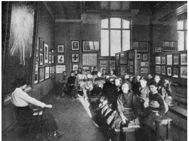
"The 'Story Hour' in the Public Library," Globe 12 April 1913. Photograph taken in the J. Ross Robertson Picture Gallery, lower level of the Toronto Public Library, College and St. George Streets.