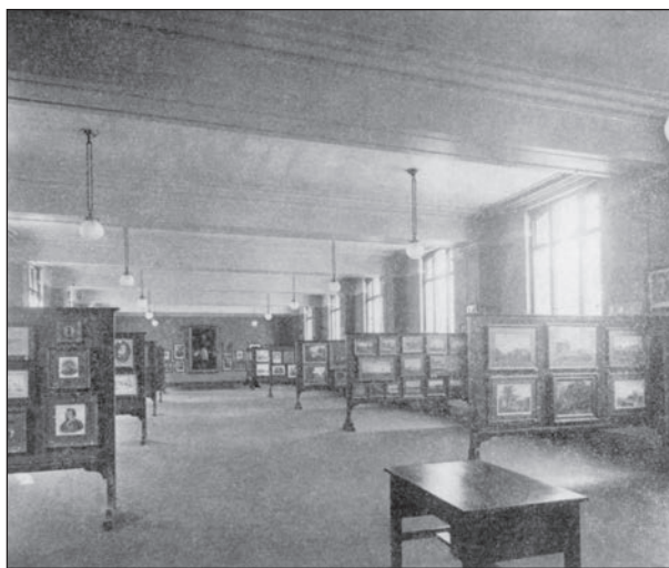
The John Ross Robertson Historical Collection on the lower floor of the Carnegie Library, reproduced from Globe, 10 February 1912.