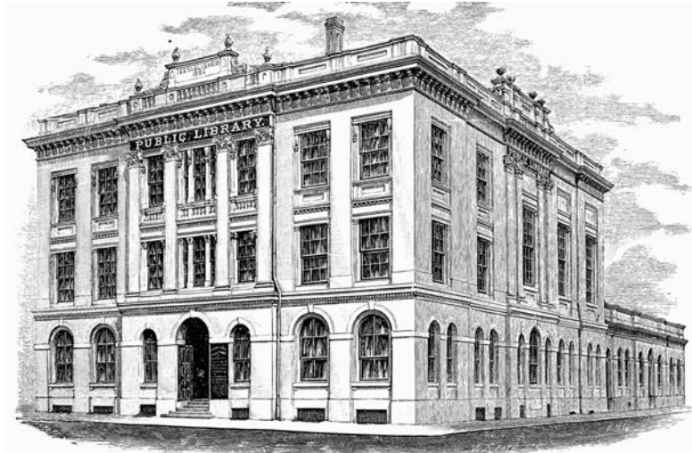
In 1883 the Toronto Public Library took over the Mechanics Institute building (1854). When the Carnegie library opened in 1908, the building became the Church Street branch. From The Ontario Library Association: an historical sketch 1900-1925 (Toronto: University of Toronto Press, 1926), 190.

and in 1856 he finally succeeded in his ambition of establishing in the Normal School building an Educational Museum for Upper Canada. Here visitors were invited to admire copies of the Great Masters and sets of engravings that had been selected by Ryerson himself, and to consult a library of art books. An art school was located on the premises nearby. The museum collections were maintained