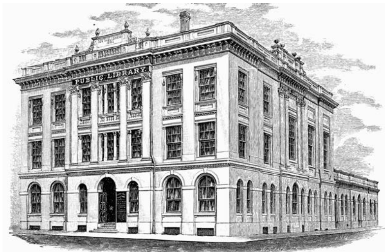
In 1883 the Toronto Public Library took over the Mechanics Institute building (1854). When the Carnegie library opened in 1908, the building became the Church Street branch. From The Ontario Library Association: an historical sketch 1900-1925 (Toronto: University of Toronto Press, 1926), 190.

and new artifacts were added into the early 1900s when it was reported they were scattered or destroyed. 19