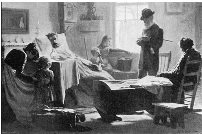
"The Foreclosure of the Mortgage" by George A. Reid, R.C.A. Soon after the artist completed the painting in 1893 it was displayed for six months at the Toronto Public Library near the entrance. The painting was acclaimed at exhibitions in Chicago and San Francisco and at the Royal Academy in London, but near the end of World War I was destroyed in a fire. Along with "Mortgaging the Homestead" it was considered to be the artist's finest work. Reproduced from Massey's Magazine 1 (January 1896), 11.

exhibition space in the city. Local artists continued to appreciate the benefit of having their work exhibited in the library where thousands of readers each year would be exposed to it. George Reid offered to hang his painting The Foreclosure of the Mortgage in the main hall of the Central Library. The Library Committee accepted the offer on the condition that it was "entirely at his risk in regard to insurance and otherwise," and for six months library users were treated to a free viewing of the 1893 painting which went on to win medals and critical acclaim in the United States and England. 43