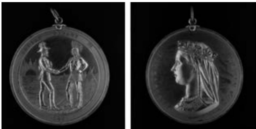
FIGURE 1 Indian Chiefs Medal (Archives Canada, 2008)

In many ways, the negotiation of treaties in present-day Saskatchewan was mutually beneficial for the Crown and First Nations. First Nations wanted assurance that they would be protected with the arrival of settlers and took various actions like denying passage to settlers until the Crown agreed to sign treaties. As Gerald Friesen (2002: 137) explains, concluding treaties was also in the Crown's interest: