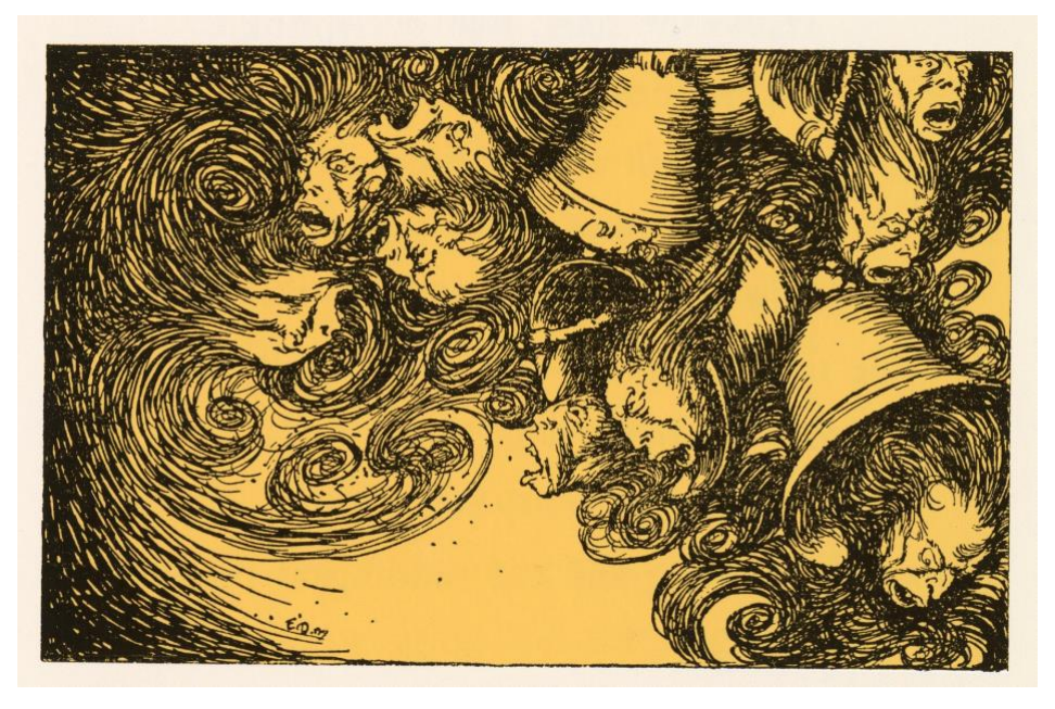
Figure 1. Edmund Dulac, Illustration for The Bells and Other Poems by Edgar Allan Poe. Published by Hodder and Stoughton, NY, 1912.

demands of the democratic polis (see figure 1). It is in this context that Poe's readers can detect the political undertones of "The Bells." In stories like "Devil," Poe laughed at the notion of a democratically-engaged electorate and encouraged his more enlightened readers to view populist leaders as deranged belfry-men and democratic mobs as being comprised of obstreperous fools.