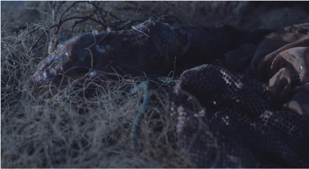
Figure 1: The creature

A creature washes ashore in a Brazilian fishing town. It is tangled in a fishing net; we can only make out its skin, burned by the salt of the ocean, cracked and leathery, adorned with iridescent pearls (Figure 1). A crackling sound, like a muffled dolphin's call, intertwines with the hissing of the sea and its waves, while the camera moves capriciously between the creature's indiscernible body and the faces of eager fishermen that try to untangle it.