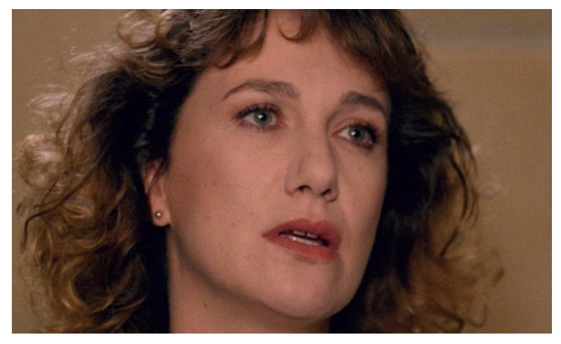
Figure 1: "Paganini's violin [...] played forever the screams of his poor bride."

As she speaks, the camera focuses on a close-up of her face (Figure 1), and it is hard not to read this moment as a statement about the real "King of Horror," especially considering Nicolodi's career as a famous screamer (Figure 2).<sup>11</sup>