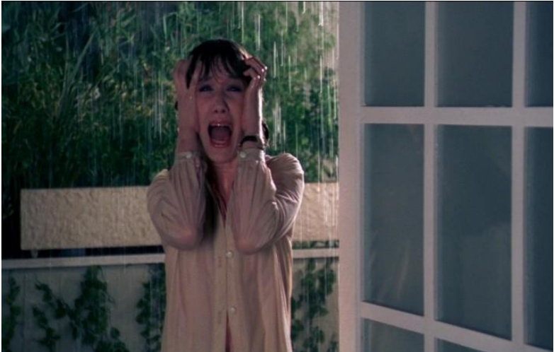
Figure 2: The iconic scream that ends Tenebrae .