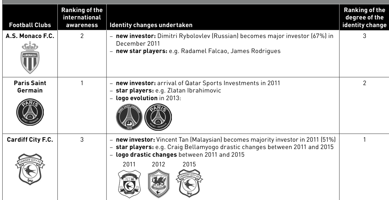
TABLE 1 The main identity modifications undertaken by A.S. Monaco, Paris Saint Germain and Cardiff City F.C.

Based on those observations, we withdrew those two last items from our analysis; Wendlandt and Schrader's (2007) reported lower loadings of those last two items on the latent construct perceived benefits of change (compared to the item PBI).