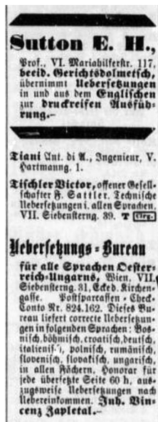
FIGURE 2 Advertisements of translation bureaus (from Lehmann 1903:744) 13