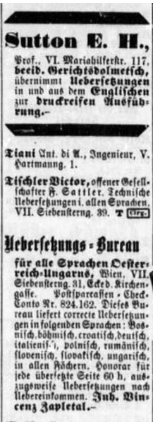
FIGURE 2 Advertisements of translation bureaus (from Lehmann 1903:744) 13