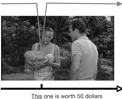
Figure 1: The integration of visual and verbal information in a film text

This kind of relationship between visual and verbal information in film can be accounted for as “visual-verbal cohesion,” i.e., one linguistic/visual element is necessary for the interpretation of another from the other mode. 3