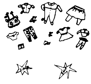
Text 4 — Child summer sale

(Good Housekeeping Magazine, 14 April 1976)