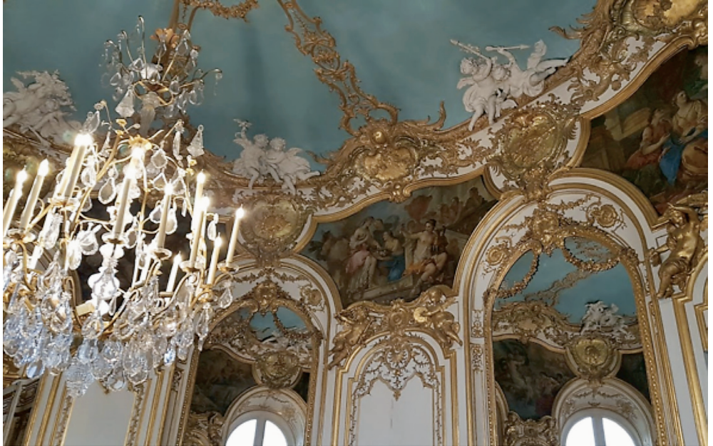
Figure 2. Germain Boffrand, Salon de la Princess at the Hôtel de Soubise , 1738–40. Paris. Photograph by author.