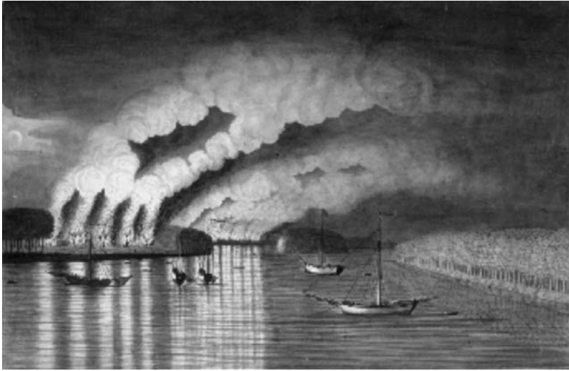
Illustration 2: Thomas Davies, A View of the Plundering and Burning of Grimross, 1758 (National Gallery of Canada).