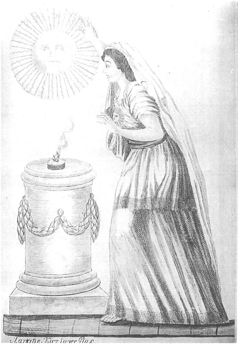
Figure 3. Cora, from The Sun-Virgin , Mannheim, 1794