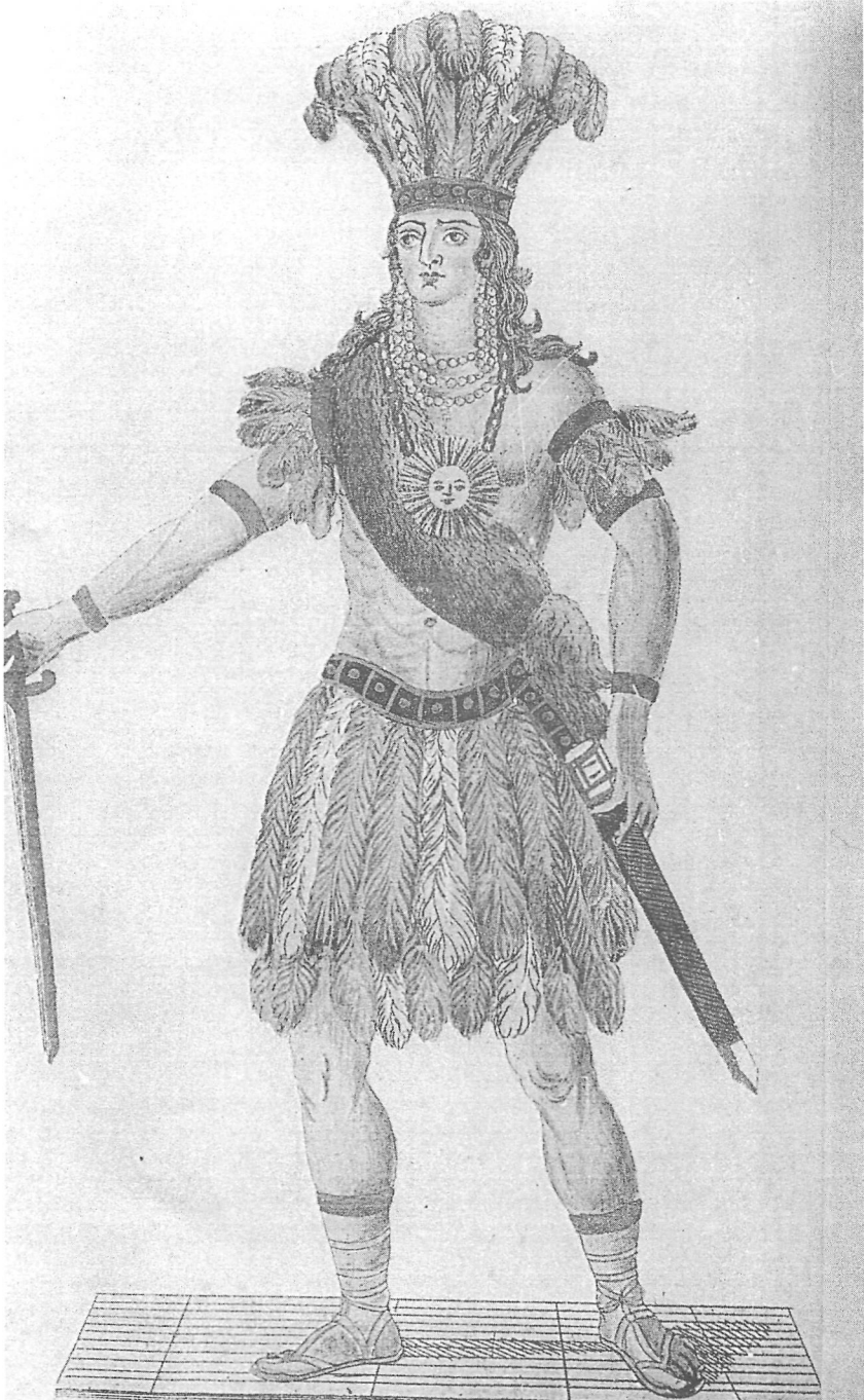
Figure 5. Rolla, from the Spaniards in Peru , Mannheim, 1795