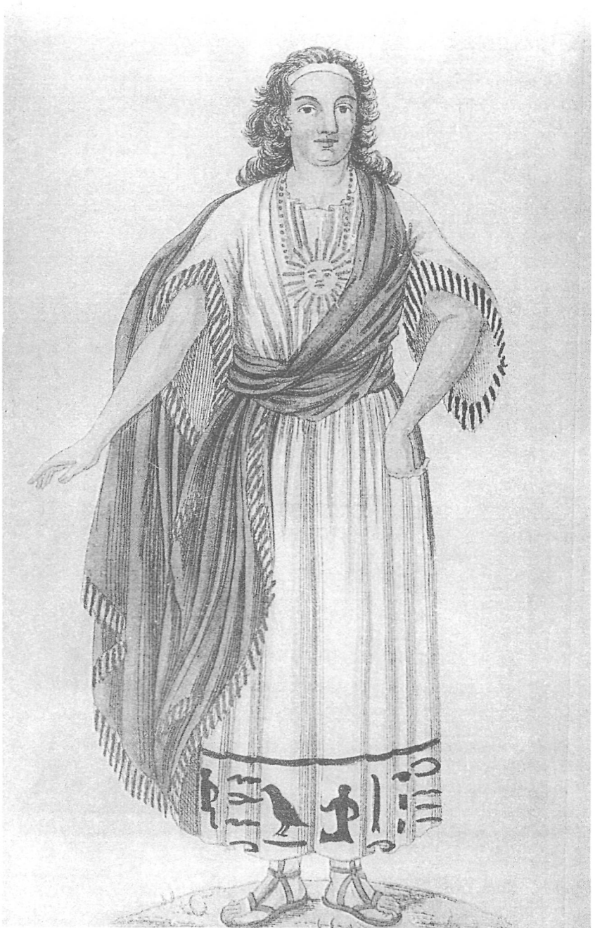
Figure 4. Sarastro, from the Magic Flute , Mannheim 1795