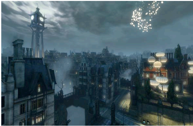
Figure 11 - A view from the rooftop of a building in the estate district. Despite civil unrest and plague, the upper class still manages to enjoy the exuberance of a masquerade ball within the fortified walls of the Boyle estate.