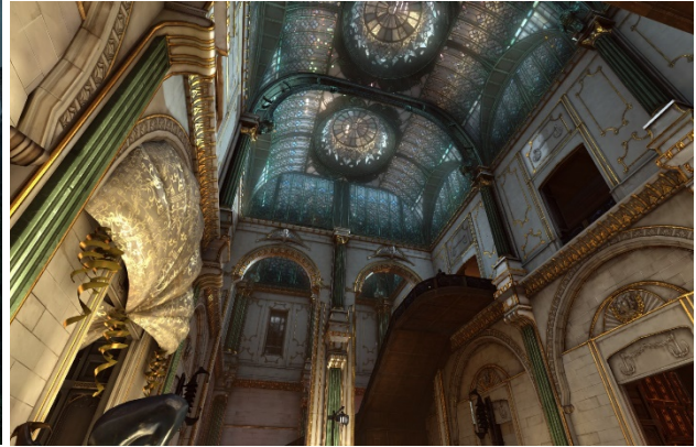
Figure 10 - The intricate Renaissance-styled architectural detailing within the decadent Boyle mansion