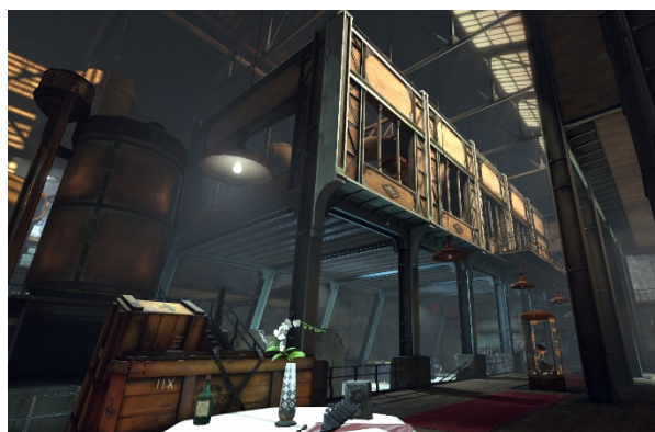
Figure 6 - The interior of Sokolov's Safehouse. The warehouse has been repurposed, and the new steel structure appears like a foreign life form tentatively hovering within the space.

in the context of our subsequent assertion that architecture is reflective of the morals of those who build and dwell within it. The following architectural examples in Dishonored demonstrate how architecture is used as visual metaphor for important characters to convey information about the game's main characters, similar to how architecture is utilized in other visual media.