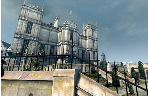
Figure 7 - Dunwall Tower in the opening prologue of the game. The player is unable to progress past the steel fence, but is allowed to explore a small area outside.