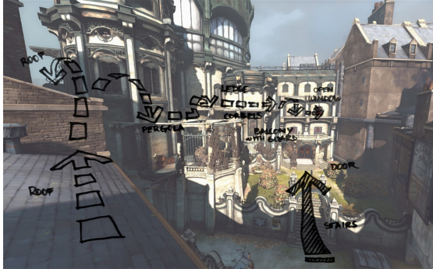
Figure 15 - A sketch showing two potential pathways into one of the buildings Corvo must infiltrate. A stealthy approach shown in dashed arrows requires the player to consider and be aware of architectural features far more than the confrontational approach shown in a solid arrow.

facilitated alternative pathways to the goal which were unseen by patrolling enemies. For instance, the horizontal lines in the architecture of the Office of the High Overseer played a functional as well as intertextual role in the game as they afford Corvo the means to scale and traverse the building with ease, unlike the unreachable ceiling spaces of Coldridge Prison and its uninterrupted vertical. In this way, the architecture in this first assassination mission works to ensure the player feels as though they have overcome the helplessness that they experienced in the prison. When playing in high Chaos, however, play was typically characterized by simply charging down the middle of an area killing everyone in the path, while paying little to no attention to the surrounding environment or architecture (this playthrough also took significantly less time to complete).