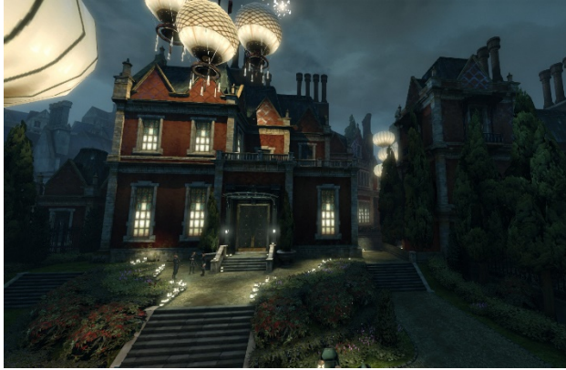
Figure 9 - The exterior Facade of the Boyle Mansion