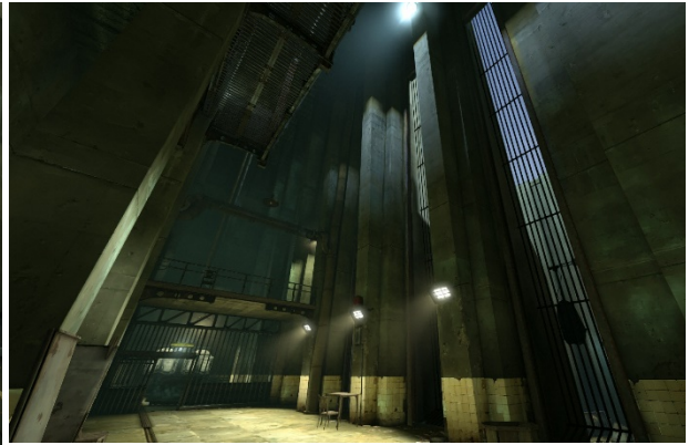
Figure 4 – An internal hallway in Coldridge Prison.