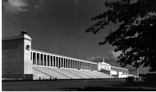
Figure 2 - The Zeppelin Grandstand, designed by Albert Speer, a part of the Nuremberg Rally