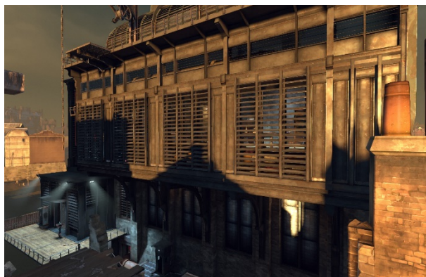
Figure 5 - The external façade of Sokolov's Safehouse. The steel structural addition is attached to the original brick façade by enormous metal corbels, casting it in shadow while the addition is allowed full solar access.