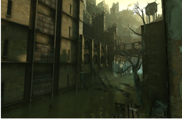
Figure 13 - Submerged warehouses and refineries litter the Rudshore Waterfront in the Flooded District, inhabited only by hostile river creatures and infected plague victims.