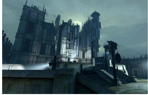
Figure 8 - Dunwall Tower following Hiram Burrows' rise to power. The lighting serves to emphasise the building's menacing visage.