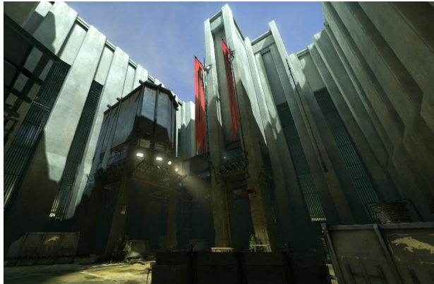
Figure 3 - An Internal courtyard of Coldridge Prison