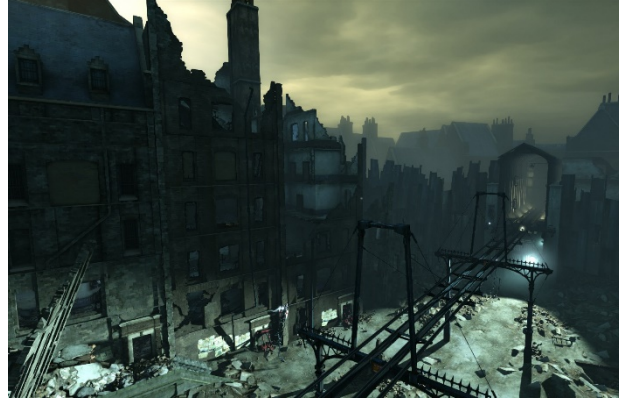
Figure 14 - Ruins in the condemned Flooded District, where very few survivors hide from the City Watch. The train tracks are used to transport and dump the bodies of plague victims.

choices. In low chaos, the ending shows Emily Kaldwin rising to the throne as a benevolent and loved ruler, bringing the city of Dunwall back from the brink of destruction into a golden age as a cure for the rat plague is developed. Conversely in high chaos, Emily will either begin a sadistic reign of terror influenced by Corvo's violent actions or be absent completely if she died in the final mission. In this case the ending shows the rest of Dunwall being decimated by the plague as Corvo flees the city on an outbound ship. The horrors of the plague experienced in the Flooded District provoke moral reflections on the consequences and influence of the player's actions. Fraser (2015) notes that "the dimension of exploration is one way in which the visual or surface content of ruins-in-games moves beyond the symbolic to shape activities that may impact or facilitate gameplay" (p.26); in this instance, we argue that it impacts the player's role as an ethical agent. Architecture in Dishonored works to shape the player's ethical agency through their interactions and observations in Dunwall by providing motivation (or deterrence, depending on their moral code) to redeem the city and save the lives of the citizens of Dunwall.