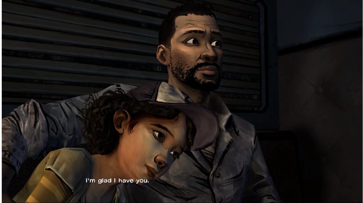
Figure 2: Lee and Clem. Screenshot taken from The Walking Dead: Season One