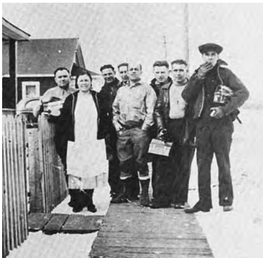
A Coniston Ukrainian boarding house operator and her Ukrainian boarders, circa 1930.

were cunning or abusive; memories of boarding houses as sites of pleasure alongside those that spoke to danger.