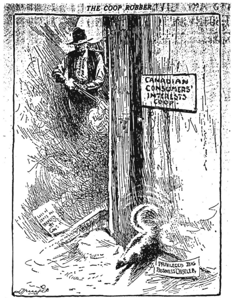
Canadian Pub. Opinion: Roosevelt's not the only man that's troubled with those varmints.

businessmen and politicians and populist appraisals of farmers and workers were quite common in the liberal press. The Star and its pious Methodist editor, Joseph Atkinson, were especially concerned about the growing inequities between Torontonians, calling upon the wealthy to do their Christian duty and help those less fortunate than themselves.