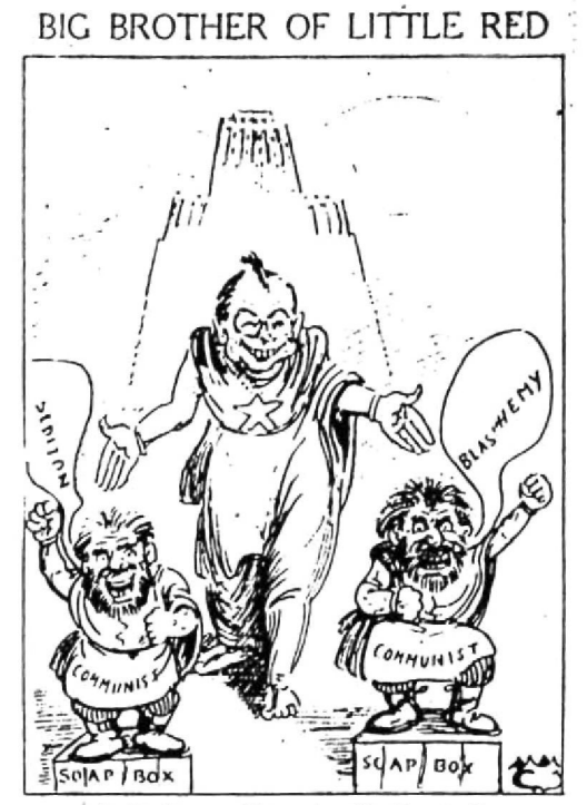
Daily Star-"These Are My Jewels."

To the Telegram the "Reds" represented a foreign menace on Canadian soil, the only solution for which was to "send them back to where they came from."<sup>62</sup>