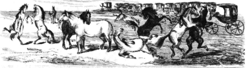
6. A RECEIPT FOR THREE.