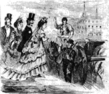
2. A WEDDING PARTY.