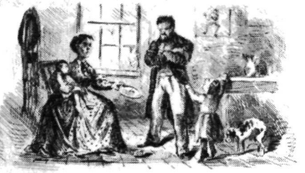
5. THE POOR CABMAN'S HOME.