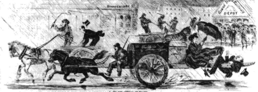
1. ON THE ARRIVAL OF TRAINS.