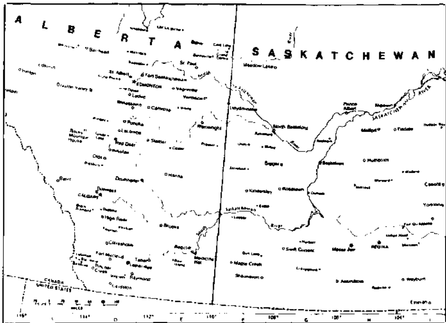
MAP 1 Alberta and Saskatchewan: Showing Points Referred to in the Text