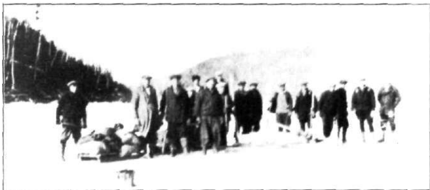
Search party of unionists on Onion Lake.

While the search party went looking for Rosvall and Voutilainen, the union also submitted a story of their disappearance to the local paper. This time they