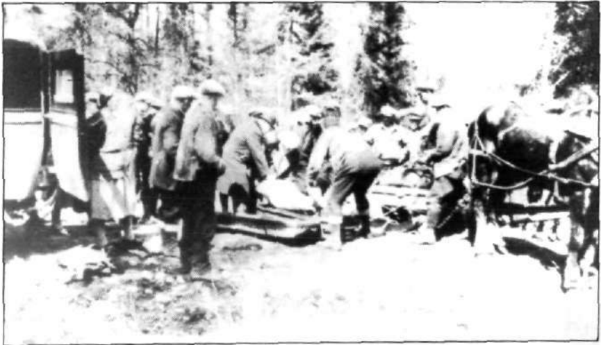
The body of Voutilainen transferred from horse sled to motorcar on Onion Lake Road.