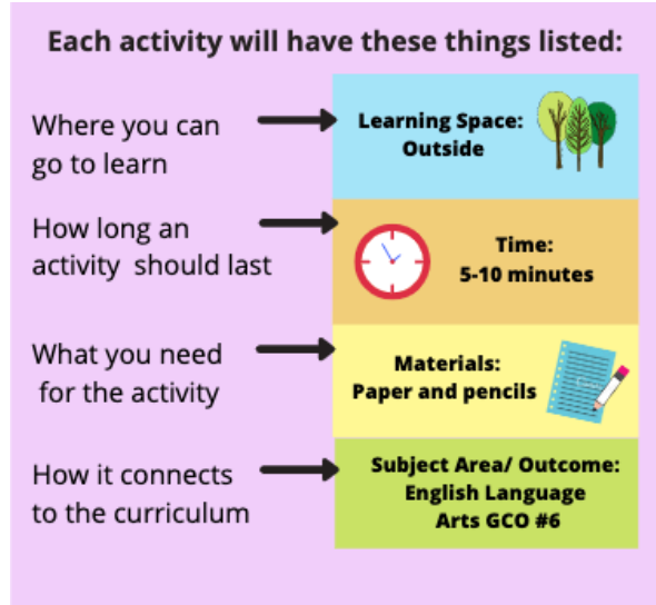
Figure 4. Explanation of Icons to Support Parents and Children in Co-navigating Lesson Plans

In addition to the icons and step by step instructions that guided parents and children through the lesson plans, the lessons included “options” that parents and children could choose to pursue. Some options could be accessed through hyperlinks to videos that explained different formats of poetry and word banks. Other options did not rely on technology and offered suggestions of additional poetry writing options using pencil/crayons and paper.