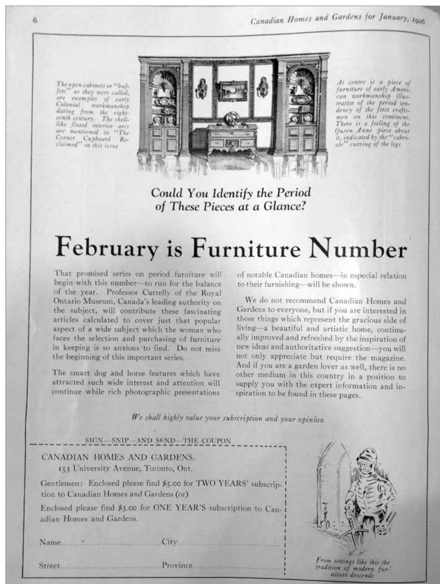
FIG. 2. ADVERTISEMENT FOR SUBSCRIPTION TO CANADIAN HOMES AND GARDENS MAGAZINE. | CANADIAN HOMES AND GARDENS , JANUARY 1926, P. 6.