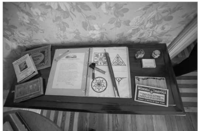
FIG. 9. A SELECTION OF DOROTHY WYATT'S ART SUPPLIES ON DISPLAY IN HER BEDROOM.

used to contest previously held assumptions about separate sphere ideologies.