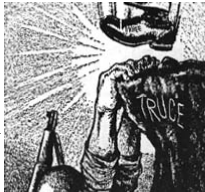
Figure 9 Resistance on the Last Ridge Don Hesse, St. Louis Globe-Democrat

By mid-1953, when peace talks were finally coming to fruition, South Korean President Syngman Rhee was often depicted as the major obstacle to achieving results. He adamantly was opposed to accepting any plan that did not reunify Korea and actually worked to undo the armistice on the eve of final agreements. 31 In Figure 9, "Resistance on the Last Ridge," Rhee's interference was characterized as significant enough to destroy the entire truce. 32