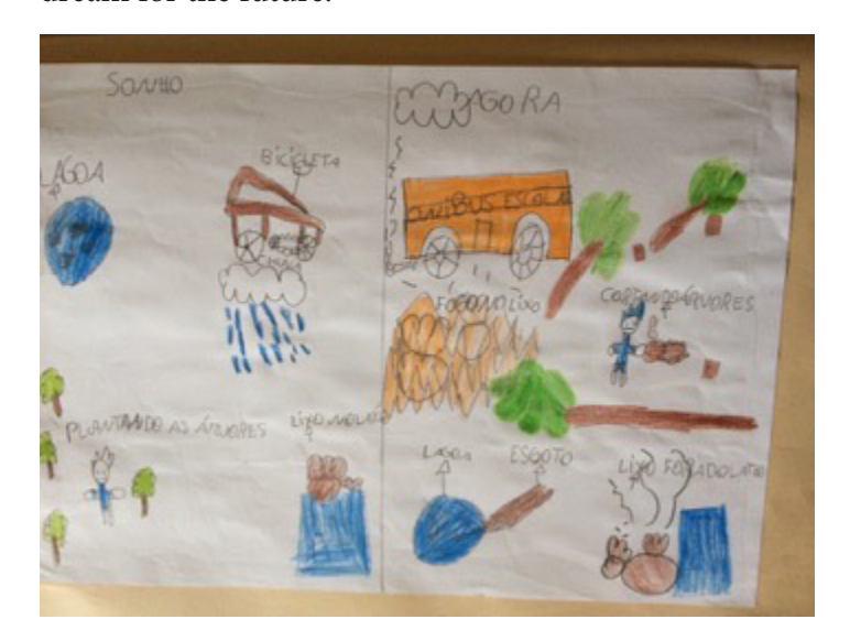
Figure 5. A child's drawing of the world that he sees (right) and the world that he dreams (left).

The children's drawings followed from a conversation they had about pollution in their community river and the act of burning trees to clear land. In Figure 5, a 10-year-old boy drew that agora (now) he sees a school bus spewing exhaust, a person cutting trees, garbage fires, the sewer leading into the pond, and garbage outside the garbage can. In the world that he dreams ( sonho ), on the left side, he drew a pond full of fish, a bicycle, rain, a person planting trees, and garbage in the garbage can. While there is a performative nature to these drawings and they are in direct response to the teacher's prompt, it does not negate the realities of the relationships that the drawings depict. The drawing in Figure 5 was created by the same child who had, prior to this activity, asked to use the camera to take a picture of the destruction of the environment. The other students' drawings were similar in that they mirrored the discussion about pollution and fire. These drawings keep our stories. They are part of the story of Earth's demise. They depict human destruction and a shared hope to live in better harmony with the planet.