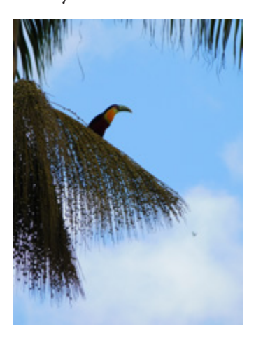
Figure 1. A toucan perched in a palm tree.

A toucan is the entry point for the visual storytelling vignettes in this paper. This is not to say that the image of a toucan (Figure 1) was the first image generated in this study. It was far from the last. However, this toucan was an invitation to us all to use our shared digital camera. Early into my second visit to this community in southeastern Brazil, I was getting reacquainted with one of the families that had looked out for me the year prior. As we discussed the many changes that had taken place in the region in the year that had passed, a toucan landed on a palm tree in their yard. I removed the digital camera from my backpack, zoomed in, and captured a photo of the bird.