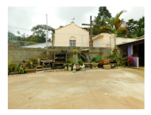
Figure 6. A photograph a child took of her grandmother's home/restaurant, the church, and the school.

Outside of the school activity to draw the world that they see, an 8-year-old girl used the camera to take pictures of everything she saw around her grandmother's home, which is the restaurant next door to the school with the woodfire stove.