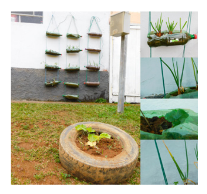
Figure 3. Composite of images taken of a plastic-bottle garden outside the school.

In this composite of photos (Figure 3), as the photographer changes the composition, the plastic is decentered and the focus shifts to the plants. Margaret Somerville (2017), in encounters with children, stones, and water, observed that the children remained silent as they recorded videos of themselves throwing stones into the water. They also framed the video in such a way that only the stones and water were visible, actively decentering themselves (Somerville, 2017). In the case of this story, the plastic bottles in these photographs were not just plastic bottles. They were a vertical garden. They were erased from view.