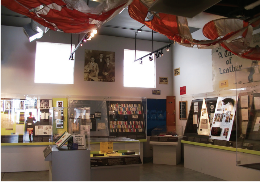
Figure 1: “Our Vast Queer Past” exhibit at the GLBT History Museum, 2014

pieces of clothing, sex toys, towels, or tarot cards. The objects housed in “grandma’s attic,” however, did not make their debut in the museum but were imbued with both the emotional character and the organization of their previous home in the GLBTHS Archives. After all, one of the primary goals of the museum was to showcase the varied items that resided in the archives, which are often only visited by researchers. Romesburg explains that “the museum was to showcase the archives’ depth and breadth, attract new collections, engage the public with the importance of queer history and powerful exhibitions linking past and present.” 47 In this way, the museum intended both to present the archival materials to the public as an education tool and to directly encourage monetary and archival donations that would benefit the archives.