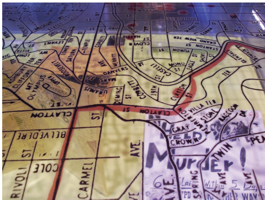
Figure 2: Aspects of the “Bearing the Scars” case at the GLBT History Museum, 2014

tourists, queer people, non-queer people, and school groups. 52 For the most part, the people who get the opportunity to make contact with these captivating objects are not those who would usually visit community archives. Unlike visitors’ experiences in many modern museums, the way “Our Vast Queer Past” staged these archival objects was also reminiscent of the experience of archival encounters.