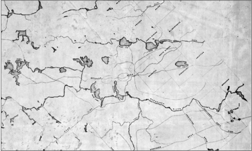
Map 2: Detail of a section of a government map of the Ottawa-Huron Tract showing the Bonnechere and Madawaska rivers and colonization roads in 1857.

matic purpose in mind — the maintenance and improvement of a way of life. Statistics from tax assessments and censuses add socio-economic layers to the discussion where necessary.