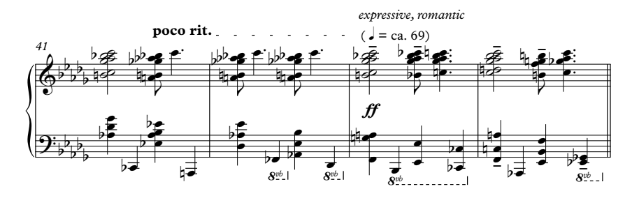
Example 2. Morlock's The Jack Pine, mm. 41-4. © 2010 Jocelyn Morlock, by permission

Although common tones prevail, there is always movement, since the composer preserves certain pitches (in the same register) from one chord to the next but rarely repeats chords exactly as they are first stated. The subtle differences allow for movement but with something always familiar. Measures 41–44 serve as a good example of this compositional strategy (see example 2). As the voice-leading analysis shows, many pitches remain the same, especially in the right hand of the piano (see figure 1). For example, the C6 is repeated in different chords in the upper voice; it moves to a C-flat6 only once before returning to C6. The movement in the left hand sinks into the lowest register of the piano. The dense chords capture the grounded tree swaying in the wind in isolation from other trees, as well as its struggle to survive as it "clings to the rock." The common tones also convey the subtle changes in colours in the painting. Although Morlock gradually alters the chords, she preserves an element of the original chord as the harmonic colours blend into each other through common tones.