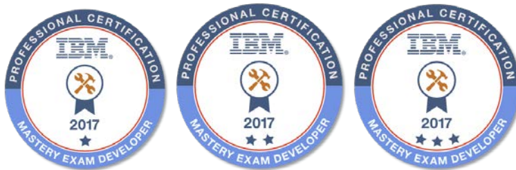
Figure 2. Tiered badging system. IBM uses stars to indicate the level of skill a particular badge represents.

Badge scope. Open badges can represent any number of skills or experiences; however, most badges are designed to represent distinct individual skills or accomplishments. In such settings, tiered systems with multiple badges (i.e., beginner, intermediate, expert) can be used to represent complicated skills.