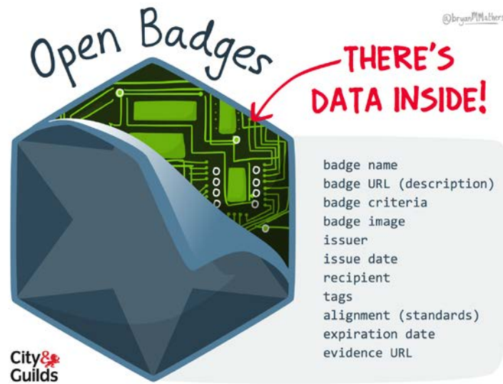
Figure 3. A visual representation of the kinds of data that can be included in an open badge. Adapted from “Open badges (P.S. there’s data inside..),” by Mathers, 2019 ( https://bryanmmathers.com/open-badges-data-inside/ ). Image is licensed CC-BY-ND.

Badge images. Although metadata often explains the significance of a given badge, the badge image is what gives the first impression. One study found the credibility of an entire program can be lowered by less aesthetically pleasing badge images (Dyjur & Lindstrom, 2017).