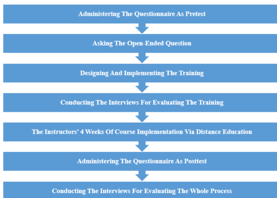
Figure 1. All procedures of the study.