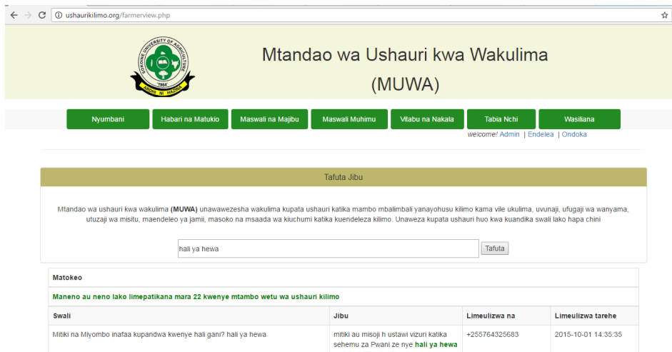
Figure 2. Search interface for the system.

A simple search in a crowdsourcing platform using the keyword “hali ya hewa” (Swahili word for weather and climate), 22 questions and answers were obtained (Figure 2).