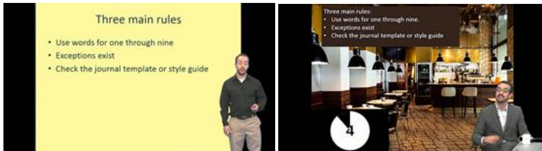
Figure 2. (From left to right) Summaries by the main lecturer (a) and guest lecturer (b).