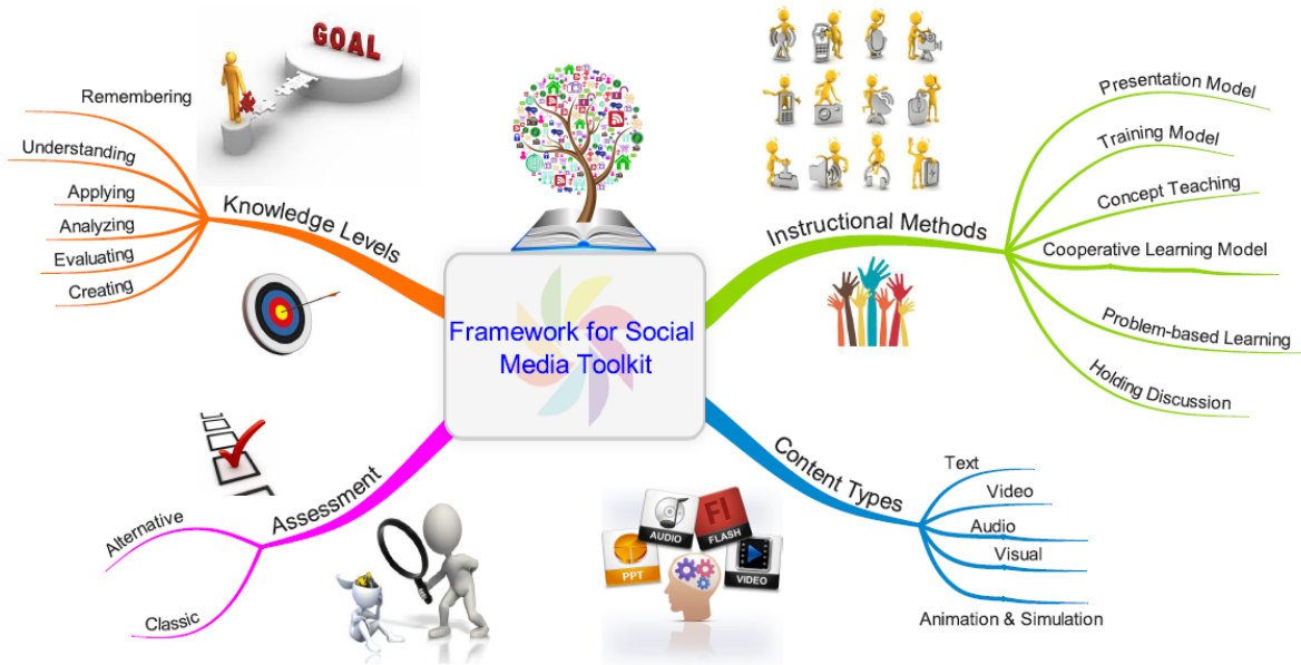
Figure 1. Framework for the Social Media Toolkit.

Instructional methods. Six well-known approaches to teaching (Presentation Model, Training Model, Concept Teaching, Cooperative Learning Model, Problem-Based Learning, Holding Discussion), three of which are teacher-centered and three student-centered, were the instructional methods selected due to their common usage (Arends, 2011; Borich, 2013; Burden & Byrd, 2013).