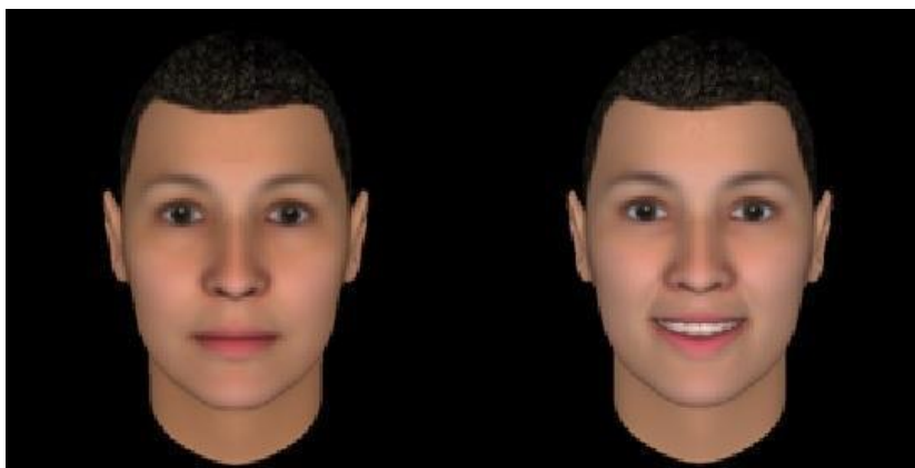
Figure 1. Neutral-face agent and smiling-face agent.

Two 3D male virtual agents were designed to convey either a neutral facial expression or a constant smiling expression (see Figure 1). The audio speech of both agents was generated using the IVONA Text-To-Speech engine (American English-Joey, default speed). The virtual learning environment served as an interactive platform for the virtual agent to deliver lessons on basic computer programming (see Figure 2).