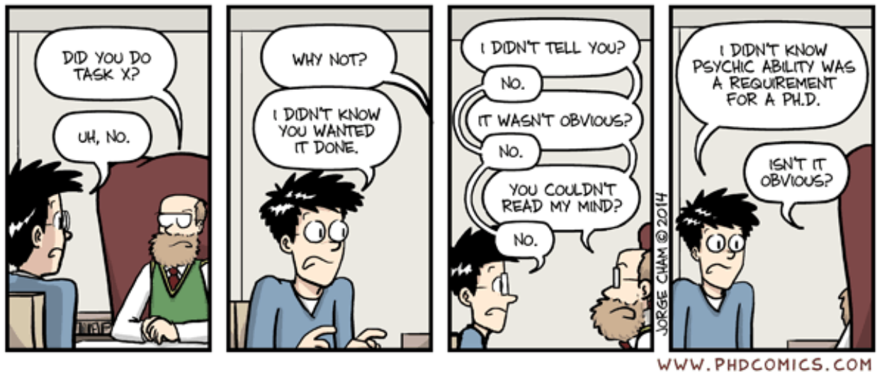
Image from PhD Comics (originally published: 2/23/2015): http://phdcomics.com/comics/archive.php?comid=1782

not clear for the PhD students what the requirements, milestones, or the most important issues are. The PhD students have no remote or distance access to the materials and important information resources, especially in the beginning of the PhD education, which makes them very dependent on their supervisors and requires them to be on campus to get information and guidelines.