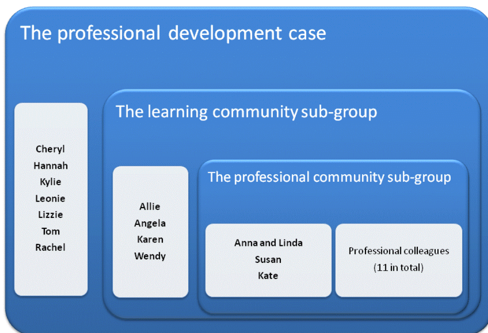
Figure 1. Embedded case design.

second level of embedded cases, the professional community subgroup, comprises a nested group of four teachers within the learning community subgroup; these four teachers add depth to the study by including data from their school communities of practice. This nested design, with embedded case studies, enables a deeper level of analysis than is possible across the holistic case. All 15 teachers contributed to an overall understanding of how teachers learn, and where they situate their learning as they engage in online professional development. The purpose of the embedded cases was not to condense teachers' experiences into a homogenous explanation of what it means to engage in online professional development, but rather to identify and illustrate the various experiences, issues, dilemmas, and impacts that contribute in some way to teachers' professional learning in, and between, communities.