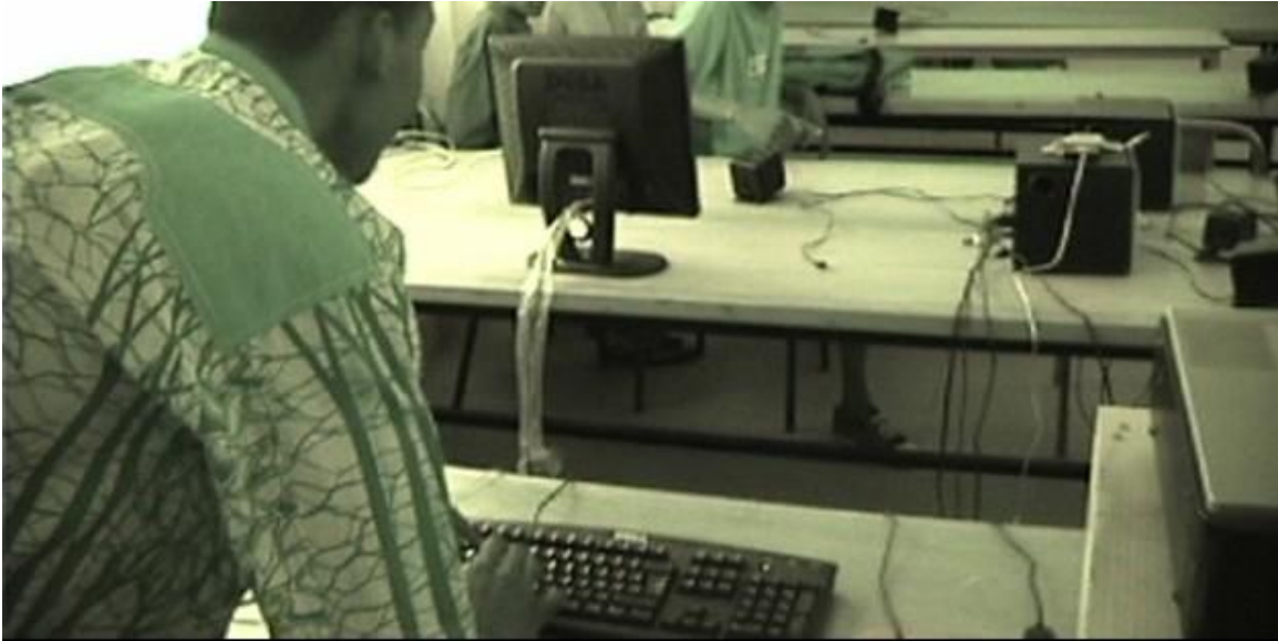
Figure 1. A partial view of the DE classroom setting at the AVU-Ouagadougou in Burkina Faso, where a student is typing an answer.