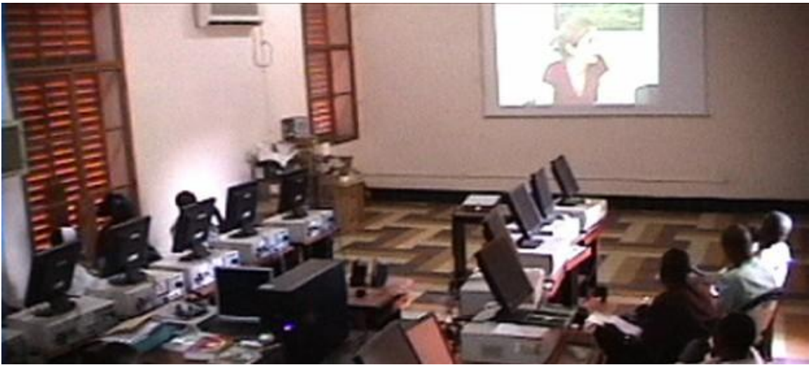
Figure 2. A partial view of the DE classroom setting at the UNFM-Bamako in Mali.