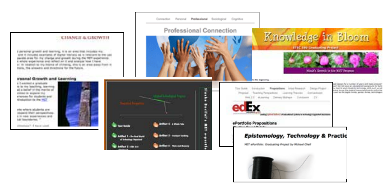
Figure 2. A collage of ePortfolios from Summer 2007

A different way in which the metaphors and hyperlinks were connected was demonstrated in DB's ePortfolio. He used visual tools (and the sidebar) to introduce each section. All those visuals and tools linked well to the overarching metaphor of learning as making choices of the appropriate tools within a workshop.