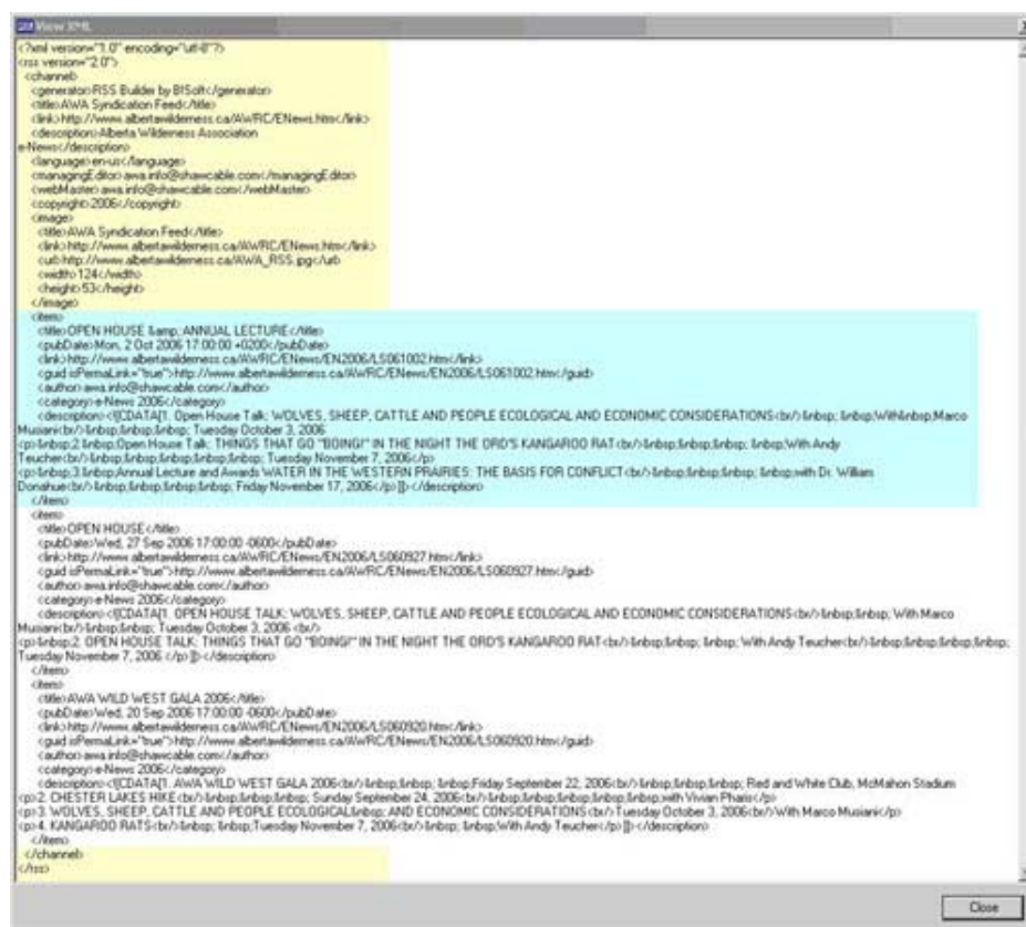
Figure 3. The XML preview window in RSS Builder displays machine readable format created from field entries in Figure 2. The XML highlighted in yellow represents then channel fields from the left area displayed in Figure 2. The XML highlighted in blue represents the first item fields from the right area displayed in Figure 2. Figure 1 is the resultant presentation for the end-user.

My recommendation is to choose the RSS editor that suites your taste. If you prefer an ASCII editor to produce the output in Figure 3, for eventual display in an RSS feed (as in Figure 1), then bon courage. For myself, however, I will stay with RSS Builder as long as it continues to be updated. The author seems to be very conscientious in responding to my inquiries in a timely manner (always a good sign). There appear to be a few other possibilities on the horizon for RSS editors, but I leave that for another discussion.