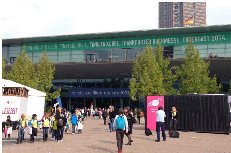
Figure 1: Finnland.Cool. in Frankfurt 2014

Finland had the opportunity to be the Guest of Honour of the Frankfurt Book Fair in 2014. Finland's presentation at the Book Fair consisted of 60 authors, over 130 books translated into German, and 600 organised events. With the presentation, Finland aimed to increase the sales of translation rights. Furthermore, the project aimed for broader coverage and recognition of Finnish culture.