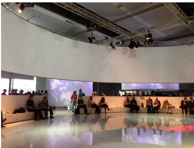
Figure 3: The Finland.Cool. pavilion in 2014.

Finland struggles with the fact that other Nordic countries have managed their literature exports better. In Germany, which is often seen as a gateway to other European book markets, Swedish literature, for example, is among the ten most translated literatures ( Buch und Buchhandel ). Even though German traditionally is the most translated language for Finnish literature, Finland had barely reached the top-20 most-translated languages in Germany before the Guest of Honour presentation (“Herkunftssprachen der Übersetzungen für den deutschen Buchmarkt im Jahr 2015”). This stems from the rather short history of Finland’s cultural exports. In the international literary field where the older literatures have gained a more central position, Finnish literature is still at the periphery. The importance of cultural exports was for a long time not recognized in Finnish cultural politics. The significance of cultural exports for building the image of the country was not taken seriously and, therefore, was not given economic value (Siikala 220–22).