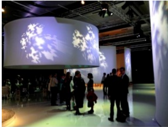
Figure 5: Finland's pavilion in the evening light.

“Finland is nature, pure and clear,” wrote the Frankfurter Allgemeine Zeitung newspaper after visiting the pavilion at the book fair (Hierholzer, translation mine). 1 The Finnish organisers deliberately avoided nation-branding and conveying Finland stereotypes and underlined the importance of literature, reading, and education in the presentation instead. Yet, the presentation was in the end still a form of nation-branding. The more the German media wrote about stereotypical Finland, the more the organisers went ahead and also cultivated this image.