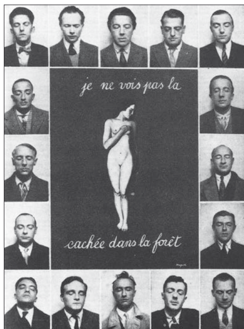
Fig. 3: Photomaton pictures of Breton's group around a painting by René Magritte, La révolution surréaliste 5/12, 1928, p. 73.

This is an ingenious example of picture policy, for not only is the dynamics between picture and text an attack on naïve humanism, but also simultaneously ridicules the self-promoting Surrealist circle surrounding Breton (which Bataille, Leiris, and several others from the Documents staff had left). Furthermore it mocks the Breton's relationship to the 19 th century and the dream. No names, no arguments, but simply a gesture of contempt, completely uninvolved: this is the strategy of this piece of picture policy. It conforms to the policy from issue to issue for a more assured concept of the journal. Documents infiltrates, experiments, and goes straight to the point.