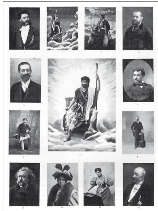
Fig. 2: Photographs by Nadar. Picture-page illustrating Georges Bataille's article "Figure humaine", Documents 1/4, 1929, p. 201.

photo to scorn and ridicule, it also affects those that follow, which are compiled and arranged accordingly. The grouping of formerly renowned actors with a Jupiter figure in the middle appears ridiculous (fig. 2). Nadar, who had photographed the dandified protagonists, seems to be scaled down to the level of a commercial photographer immortalizing the vanity of the subjects photographed. But that is not all. With this composition, the surrealists surrounding Breton were also attacked: the informed observer recognizes the template of the photo page with which Breton's group staged their program for La révolution surréaliste . Georges Didi-Huberman confronted the image with its missing counterpart on the double page (fig. 3). 15