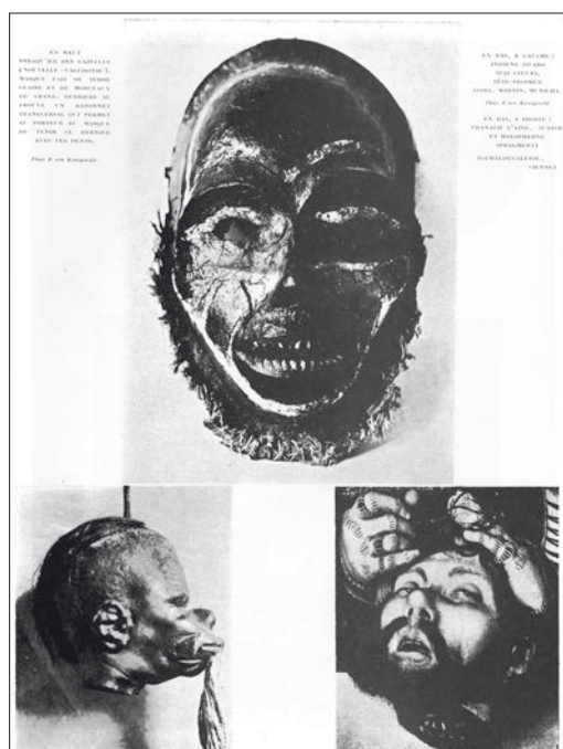
Fig. 1: Ethnographic photographs and a detail from Cranach's Judith and Holofernes . Picture-pages illustrating the article by Ralph von Königswald "Têtes et crânes", Documents II/6, 1930, p. 356.

Rather, it is a strategy of subversion. The manner in which objects confront one another is not based on some incantation of magical connections nor determined by trans-cultural values. It aims at démontage . Without polemics enmeshed in daily ideological debates, bourgeois certainties and ideals are exposed to attack. The choice of themes is made with an anthropological view devoid of humanistic disguises.