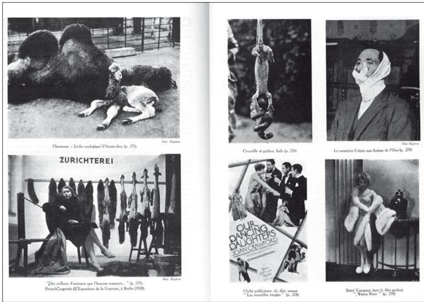
Fig. 4: Camels in the Zoo (Foto Keys tone); promotional pictures for a Fur Trade Fair in Berlin 1928 (Foto Keystone); Crocodile and Python, India; The Murderer Crepin (Foto Keystone); promotional pictures for the Talkies Our Dancing Daughters and Weary River . Picture-pages in Chronique-Dictionnaire, Documents 1/5, 1929, p. 276-277.

the clothesline behind her. Although the crocodile, already half-devoured by a python, seems to be a contrasting image of the cruelty of animals, it is in fact also the result of human action: the frame of the picture is set in such a way that one cannot see the hand that playfully holds the crocodile up to the python. Leiris unites perpetrator and victim in the rubric "Reptiles" and, from a few ethnographic suggestions, constructs a pseudo-symbolic meaning where the reptiles appear as an accurate depiction of human existence, "traversée du haut en bas par la mort et l'amour". 17 It reads like a parody of the surrealist iconography of the praying mantis, so extremely fascinating because of the simultaneity of mating and death. 18