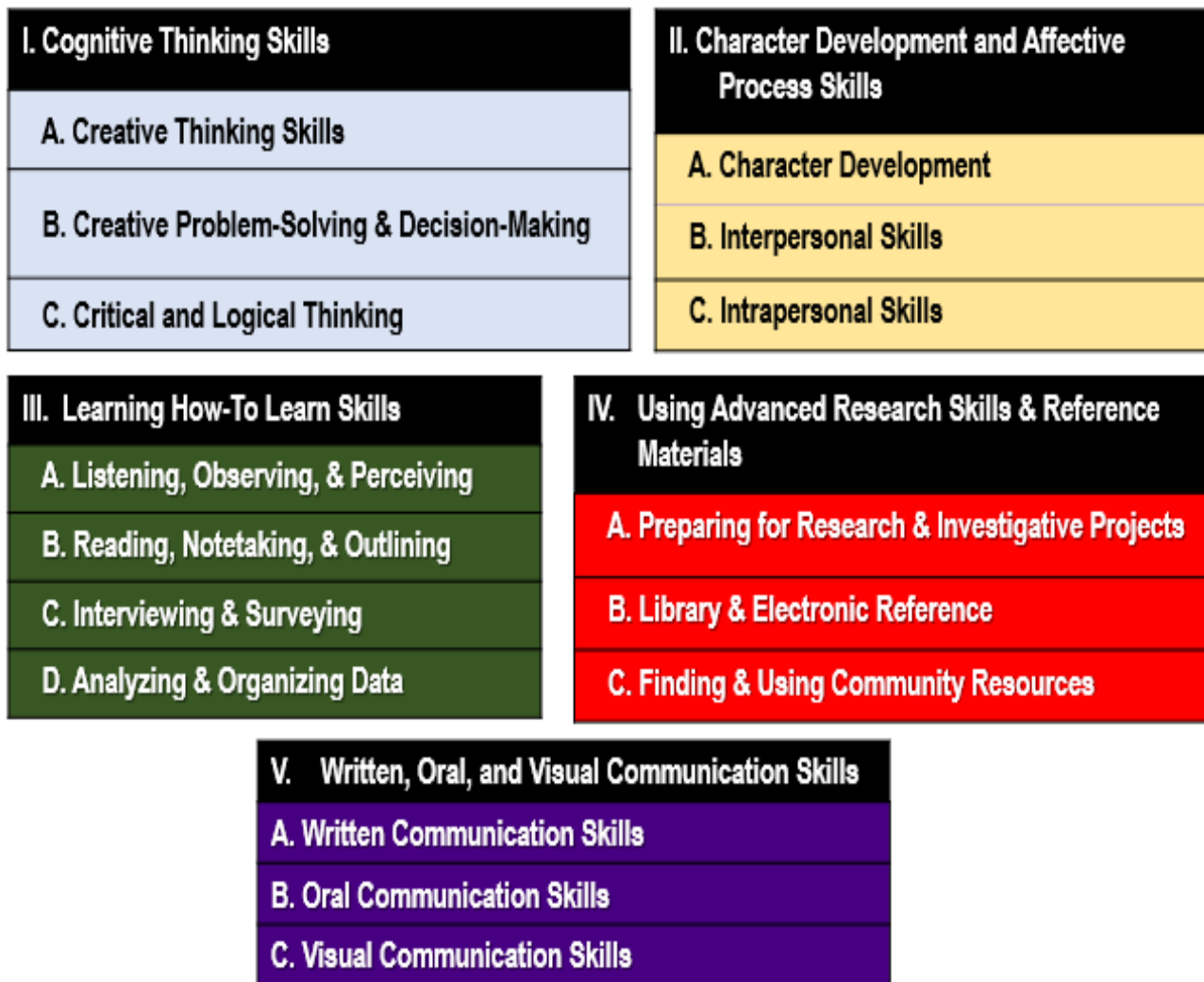
Figure 4: Taxonomy of cognitive and affective processes.

The goals of Type III enrichment include: