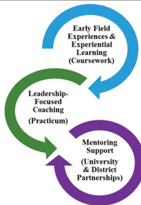
Figure 1: Conceptual diagram of model

The final part of the conceptual model involves mentoring support within the school district. Once in leadership positions, districts would select principal or district-level mentors for new instructional leaders. University instructors would support this by developing and providing ongoing mentoring workshops, professional development, and resources for such mentors.