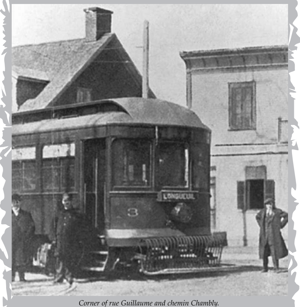
Corner of rue Guillaume and chemin Chambly.

With the acquisition of three new diesel locomotives in late 1951, electric service to Granby ceased on Saturday, November 24, 1951 and was replaced by diesel service the following