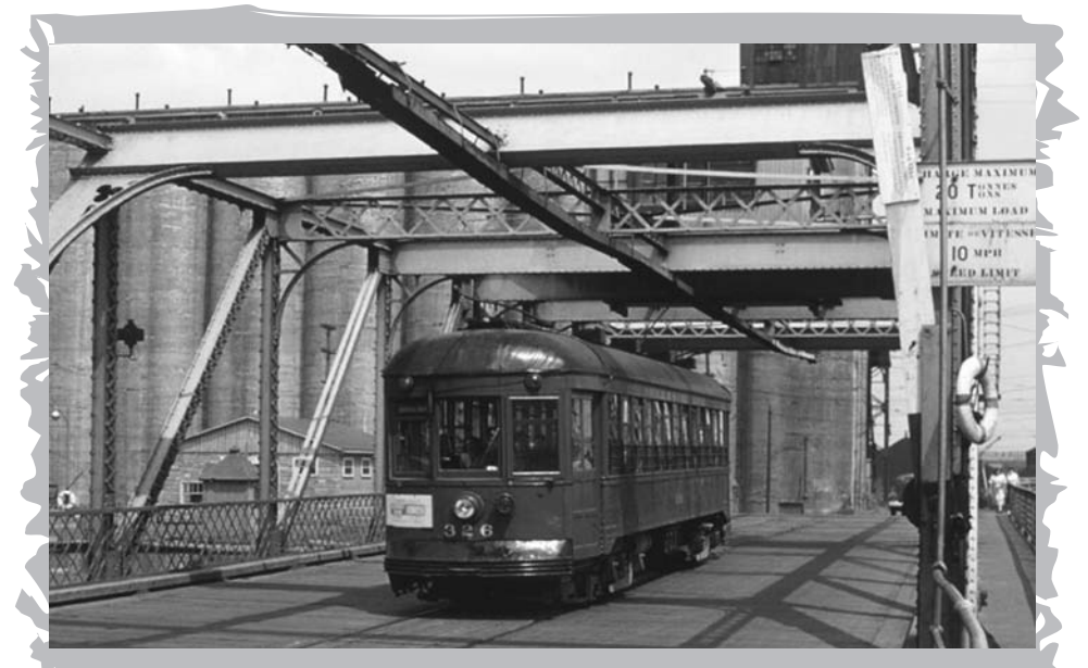
Crossing Black's Bridge over the Lachine Canal in June 1955.

years of electric service came to an end. Earlier on that day, 45 members of the Canadian Railroad Historical Association made a commemorative trip on a special. Car #101 made the