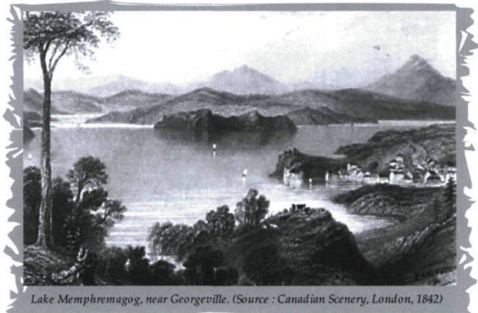
Lake Memphremagog, near Georgeville.

Designed in 1939 by the American-born architect Ernest Isbell Barott to replace the main building of Stanstead College, destroyed by fire, this handsome red brick pavilion shows the influence of American colonial