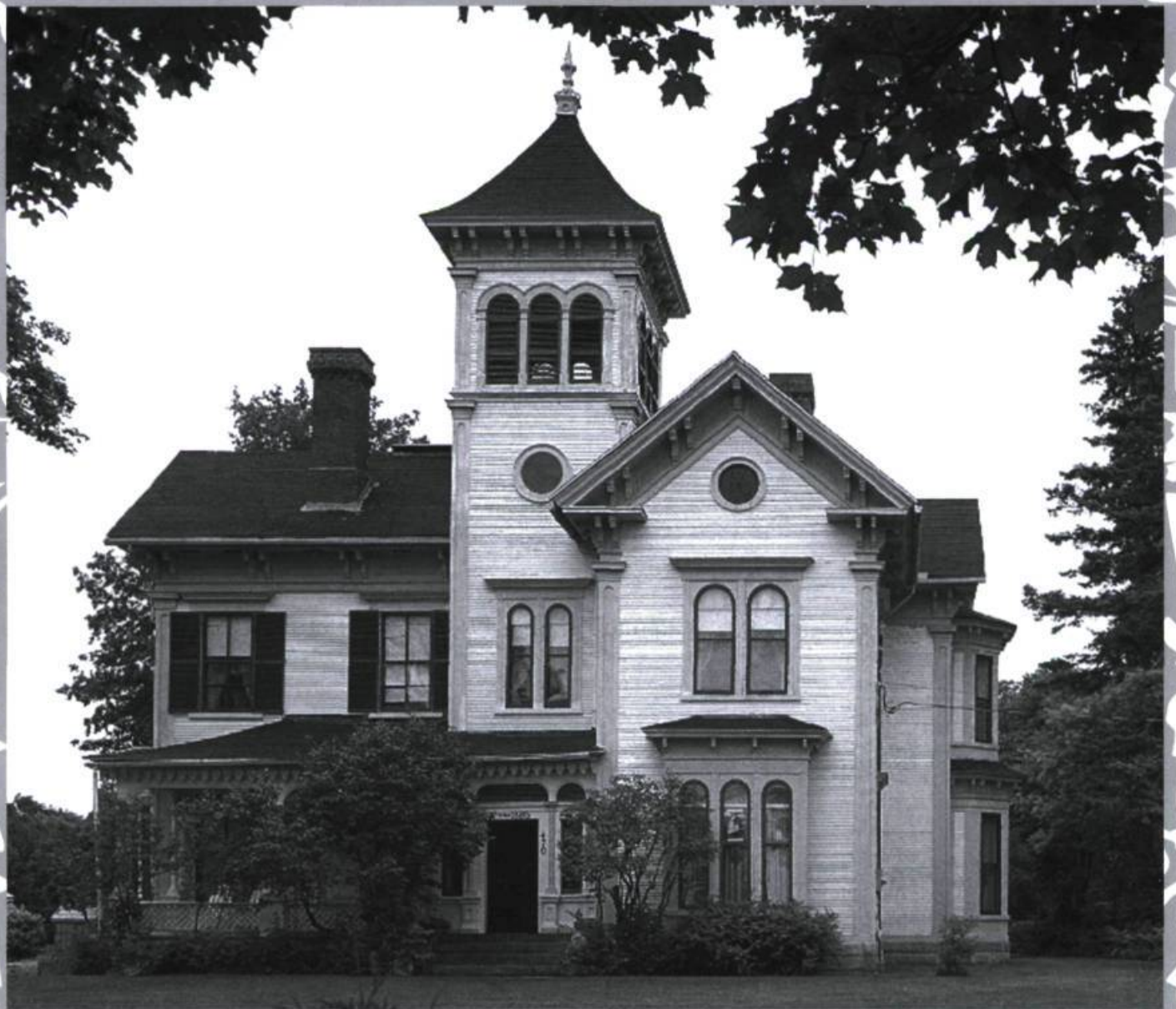
The Butters Residence, c. 1863, Stanstead.

It operates a charming seasonal museum at Eaton Corner, in an old Congregationalist church dating from 1841, now classified as a heritage building. Open during the summer season, the museum presents artefacts related to the lifestyle of the region's American pioneers.