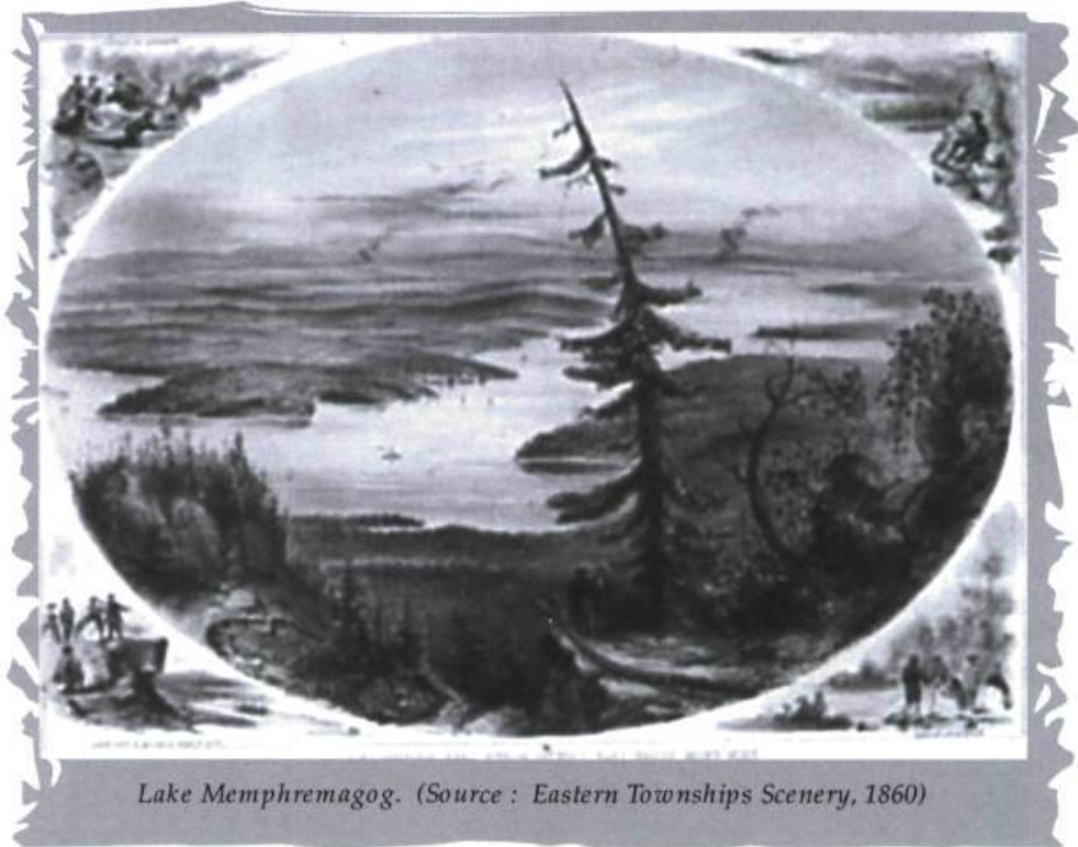
Lake Memphremagog.

architecture. The symmetrical, rectangular block features three arches at the center of the main façade, with a gable roof pierced by dormers and crowned by a cupola. Set back from Dufferin Road and enhanced by an attrac-