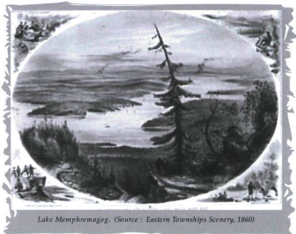
Lake Memphremagog.

The town of Stanstead, where a remarkable display of heritage architecture can be seen, offers several important institutional buildings with marked influence from American, British and French settlers.