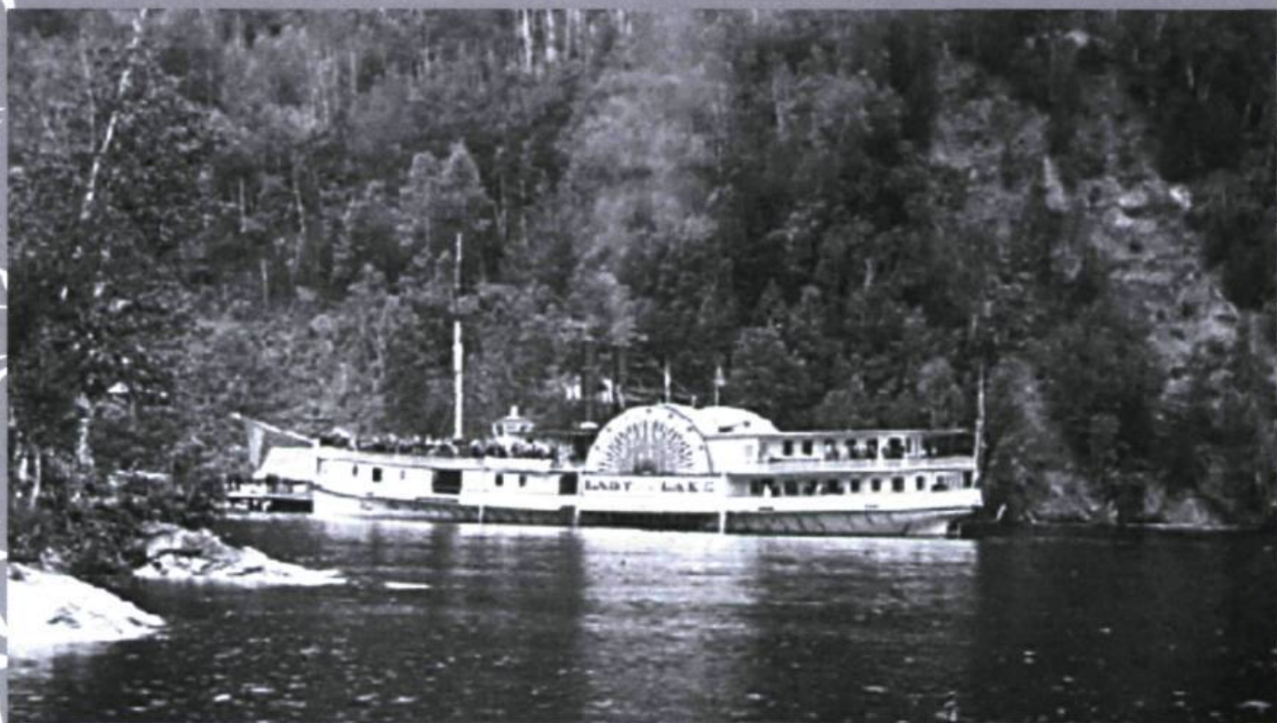
Lady of the Lake, c. 1887.

tain Maid , the first steamboat to navigate in the south of the province, was launched at Georgeville. This was the beginning of a full century of steamer operations on the lake, used mostly to carry resort visitors. During the second half of the XIX th century, seven other steamboats operated on the lake, the most important being the Lady of the Lake and the Anthemis , both of which offered a regular shuttle between