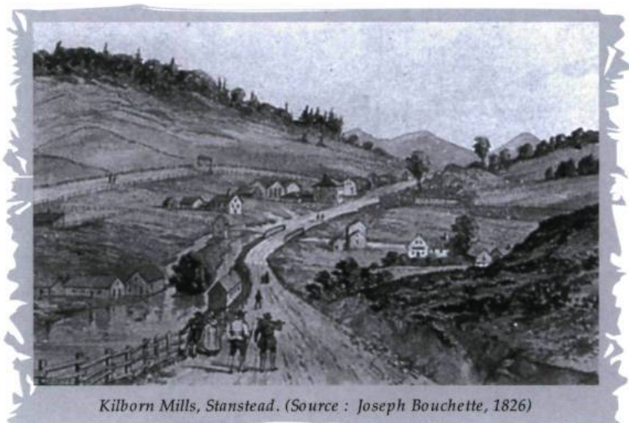
Kilborn Mills, Stanstead.

The Americans were the first to come. Among them, there was a small number of Loyalist refugees but, on the whole, they were mostly people looking for good land to farm and settle. Held back close to the Atlantic shoreline before the Erie canal