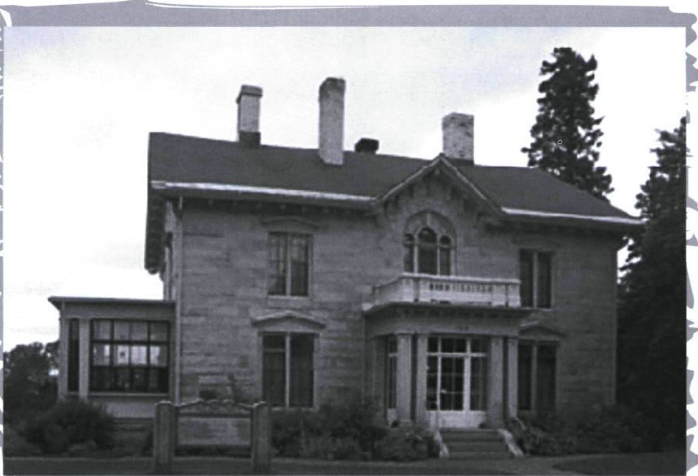
Carrollcroft, 1859.

Also located in Stanstead, the Ursulines Convent, first erected in 1884, is in the neoclassical style favoured by most catholic convents in Quebec. The original building with its mansard roof recalls the Ursulines long history as the first teaching order in Nouvelle-France. A second wing was erected in 1894 and a third, built in 1907, is featured in the photograph. As the convent's chapel is located in this wing, the roof is adorned with an elegant steeple, a traditional feature in Quebec convent architecture.