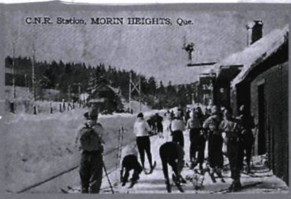
CNR Station – Morin Heights, c.1940.

more easily to commercial development than cross-country. The sale of tickets to ride the tows provided an obvious beginning, as did chalets with food services and warm-up areas. Hotel owners, ranging from small family-oriented establishments to full-fledged European style resorts, invested in ski hills and many, after the nineteen-thirties, built