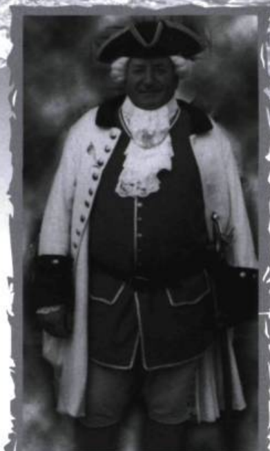
Your most faithful, obedient and humble Servant...

tury re-enactor from the market in Old Montreal for assisting us to step back in time.