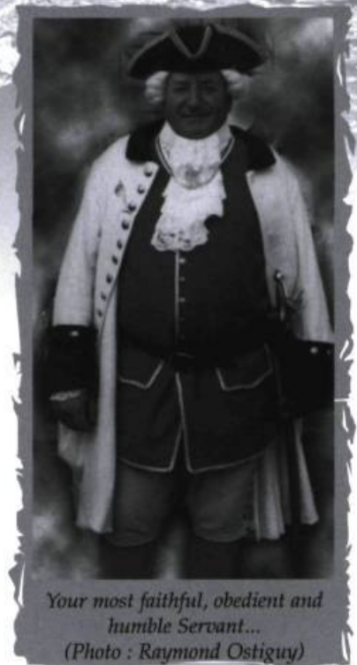
Your most faithful, obedient and humble Servant...

tury re-enactor from the market in Old Montreal for assisting us to step back in time.