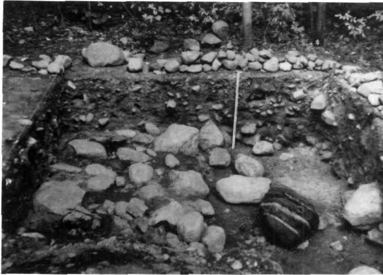
FIGURE 3. Boulder bed with meltwater sands and section of overlying till. Lit de blocs dans des sables fluvio-glaciaires et coupe du till sus-jacent.