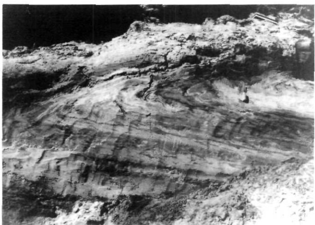
FIGURE 4. Lenticular, undulatory and flaser bedding, Unit 4. Note the folded nature of the sediments (scale = 25 cm).

Rythmites de l'unité 3 (sous-unité 3a = gris pâle, Sous-unité 3b = gris foncé) et de l'unité 4 (échelle = 18 cm).