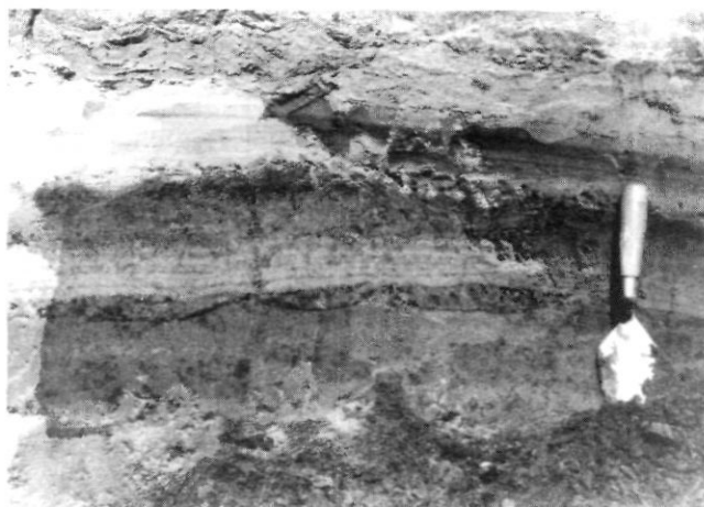
FIGURE 5. Iron oxide aureoles, Unit 4 (scale = 25 cm).

The gradational upper and lower contacts of Unit 5 enclose a thin sequence of asymmetrical current ripples and lenticular