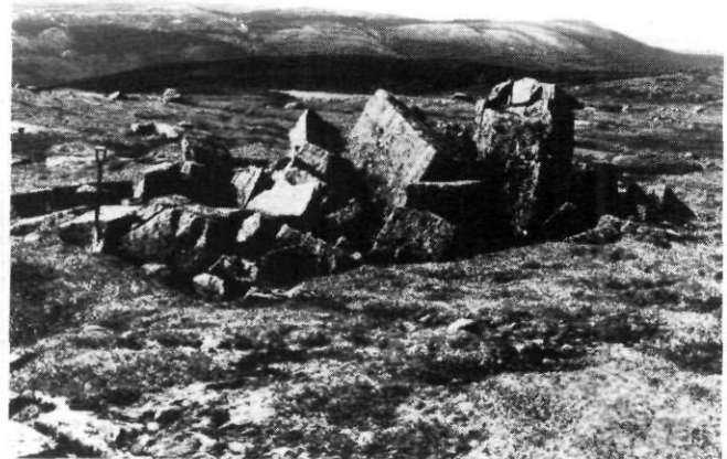
FIGURE 8. A frost-heaved bedrock feature in which most fragments are thrust; in a gabbroic bedrock, in Groulx Mountains. The shovel is 90 cm long (7.24.80).

Édifice d'éjection de forme conique et de taille moyenne, d'environ 2 m de haut, dans des roches cristallines montrant quelques blocs légèrement basculés, au sommet des monts Groulx (24.7.80).