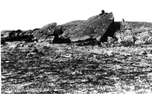
FIGURE 10. A ridge-like frost-heaved feature in basalt, occurring along an elongated glacially sculptured outcrop, at Lac Guillaume-Delisle. The largest fragment is 6.5 \times 7 \times 13 m, and shows a maximum vertical displacement of 150 cm (8.7.82). Crête de soulèvement gélival dans du basalte au lac Guillaume-Delisle, développée au droit d'une colline rocheuse à modelé glaciaire. Le plus gros fragment mesure 6,5 \times 7 \times 13 m et a été soulevé d'environ 150 cm (7.8.82).

Field observations indicate that frost-heaved bedrock features occur in a large variety of topographic conditions, i.e. on nearly horizontal surfaces, on gently sloping surfaces and even on slopes up to 15-20 degrees. However, most sites are found on gently sloping surfaces of less than 5 degrees. Conical mounds made up of a cluster of fragments are commonly found around shallow, poorly drained depressions in the bedrock surface into which water tends to collect and where the water table is close to the surface. The largest structures observed in subarctic Québec occurred in such an environment (PAYETTE, 1978; Dionne, 1982, unpubl.). The presence of water is prerequisite for the development of single block and mound structures because the upward displacement results from the freezing of free-water in joints and particularly in horizontal planes or in cavities under rock fragments. In most cases, the only water available is that from snowmelt and rain. Free-water draining into shallow depressions fills joints, fissures and cavities in bedrock and is introduced between horizontal strata and sheeting planes. During the winter, this water freezes and forms ice masses, the main cause of frost-wedging and heaving. In most sites, the bedrock surface is commonly bare and well exposed, but locally it may be covered by a thin sheet of till (15-20 cm thick) or of organic debris (usually less than 30 cm in thickness).