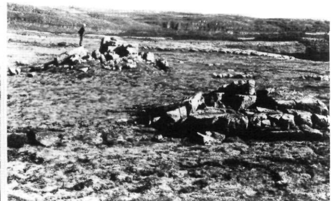
FIGURE 2. A large frost-heaved block of basalt projecting through a glacially polished and sculptured bedrock surface, at Lac Guillaume-Delisle (Richmond Gulf) (56°N), subarctic Québec. Vertical displacement is approximately 125 cm (8.7.82). Méga-bloc de basalte soulevé par le froid, d'environ 125 cm au-dessus de la surface glaciaire environnante, au lac Guillaume-Delisle, Québec subarctique (7.8.82).