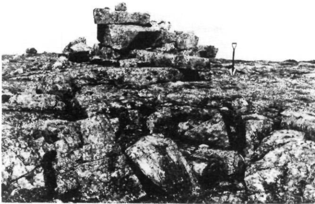
FIGURE 6. A common frost-heaved bedrock feature in gabbro, made up of several large angular fragments, in Groulx Mountains. Note the perched glacial boulder at the top of feature (7.24.80).

Édifice de soulèvement gélival typique dans des gabbros, formé de plusieurs gros fragments anguleux, au sommet des monts Groulx. À remarquer le bloc glaciaire perché au sommet de l'édifice (24.7.80).