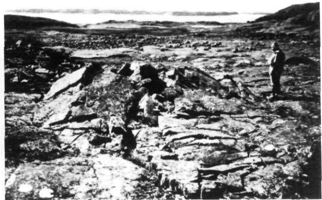
FIGURE 11. A dome-like frost-heaved feature in basalt, about 8 m in diameter and 100 cm high, at Lac Guillaume-Delisle (8.7.82). (Photo: Linda Dion.) Structure de soulèvement en dôme dans du basalte, d'environ 8 m de diamètre et 100 cm de haut, au lac Guillaume-Delisle (7.8.82). (Photo: Linda Dion.)

Depending on ground conditions (BROWN, 1969), the southern margin of the continuous permafrost zone in Canada, according to most authors, follows closely the mean annual air temperature isotherm of -7^{\circ} to -8^{\circ}\text{C} , while the southern limit of the discontinuous permafrost zone is close to the mean annual isotherm -1^{\circ} to -2^{\circ}